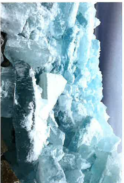
Spring Ice Shoves ~ Stunning Beauty In All Seasons!

Bring your fishing pole to Oconto and you will soon find out why we are the unofficial Walleye Capital of the World!